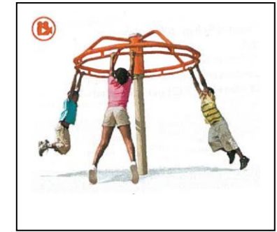
2 of 14